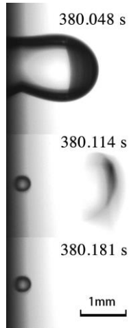
Figure S3. Sequence of pictures of a 2 \mu\text{L} pulled water drop that mostly moved slowly at the first stage (c.f. Figure 4) so that by the time it finally reached the third stage, it flew away instead of sliding down. (Video 3)