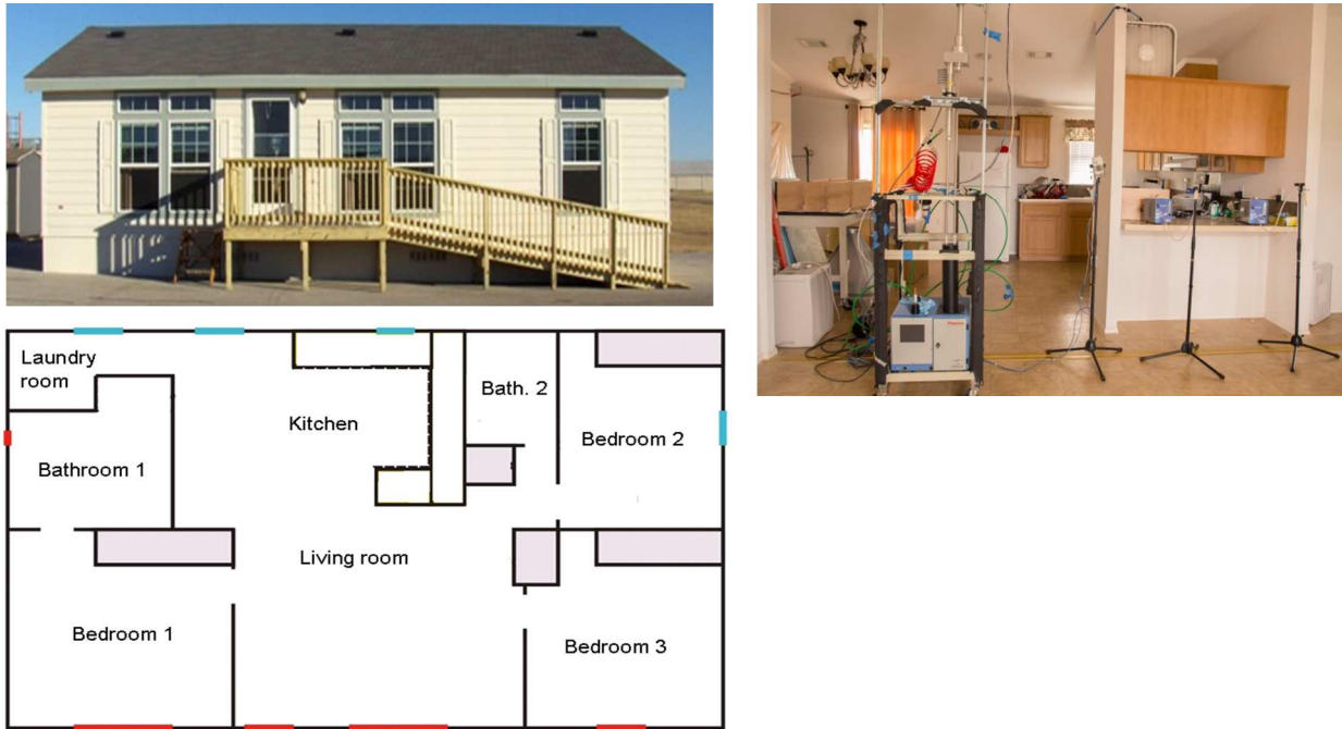
Figure S1. Exterior, interior, and floor plan of the UTest House