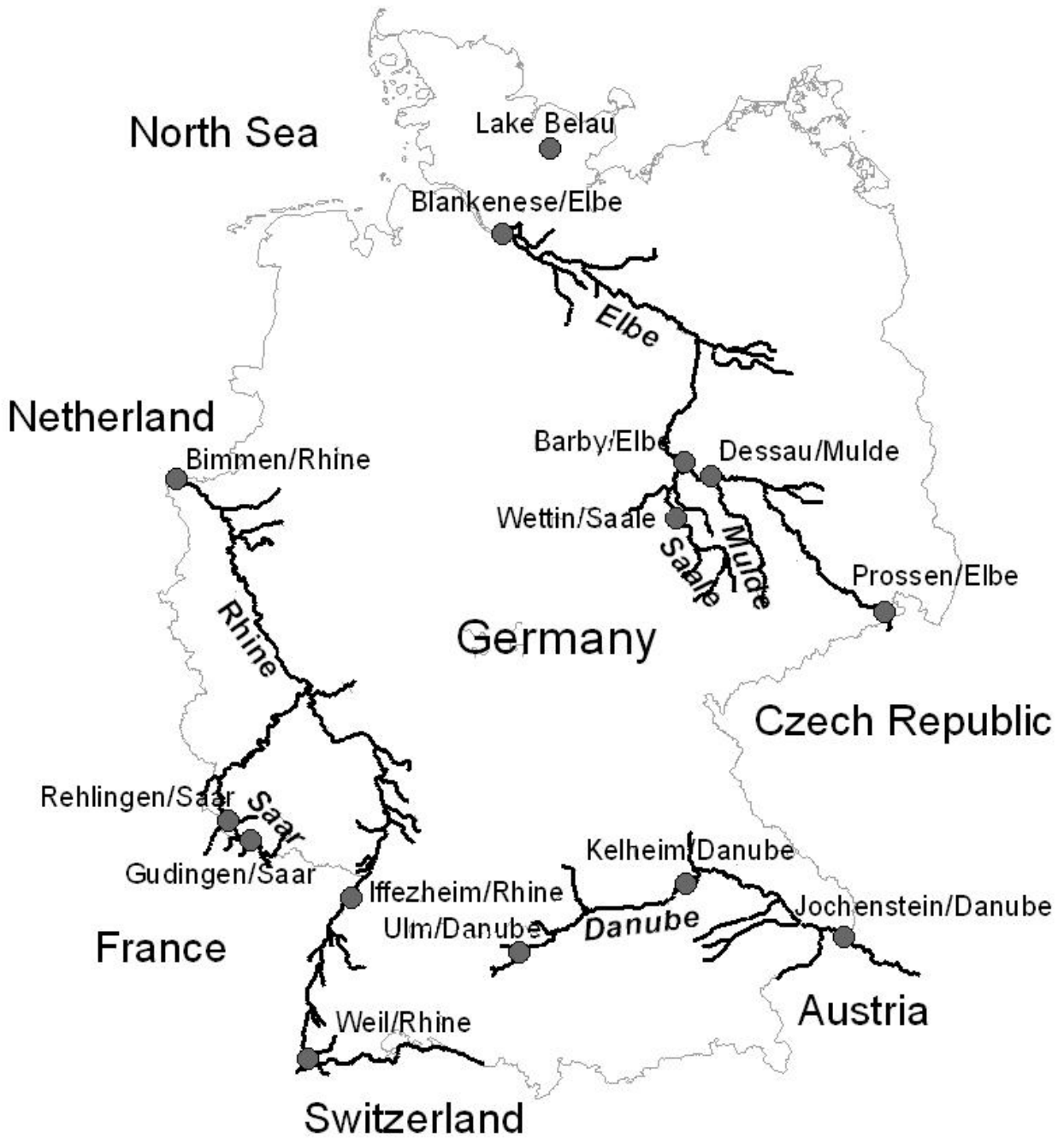
Figure S1. GESB sample locations