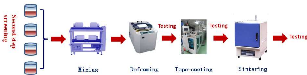
Figure S3 Facilities and procedures for second step screening.