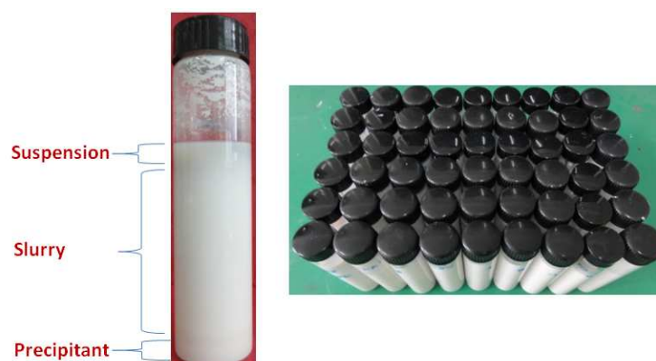
Figure S2 Photograph of the slurry library for sedimentation experiment.

For the first step screening, the rheology and sedimentation properties were tested. The viscosity and shear strength of the samples were measured using a NDJ-79 (CNSHP, China) rheometer in sequence. The stability of the slurries was checked by sedimentation experiment. In detail, the slurries were put in glass bottle (2 cm in inner diameter) stationary for one month and then the volume ratio of the uniform slurry part was calculated by V_{\text{slurry}}/(V_{\text{suspension}}+V_{\text{slurry}}+V_{\text{precipitant}})\times 100\% (Figure S2). The higher V_{\text{slurry}} value, the better slurry stability.