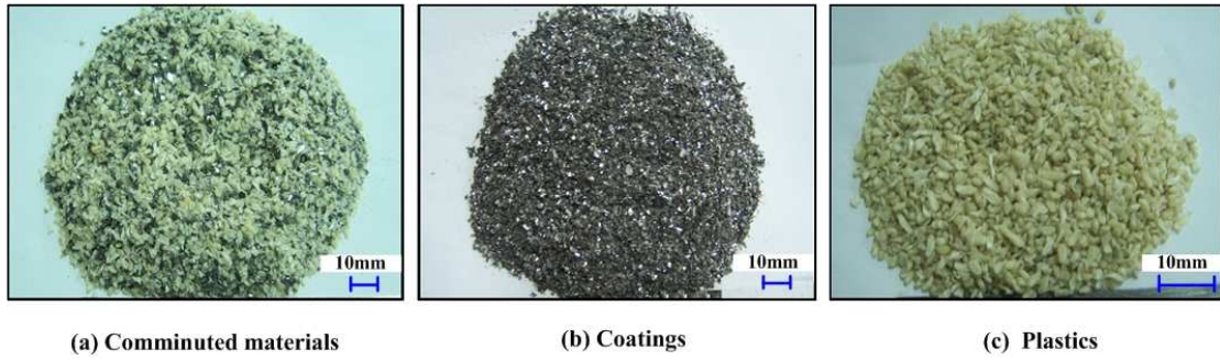
FIGURE S1. Liberation characteristics of MPP