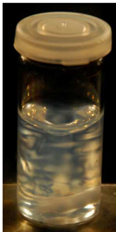
Figure S1. Image of a suspension of cellulose nanocrystals in DMF showing flow birefringence under crossed polars.