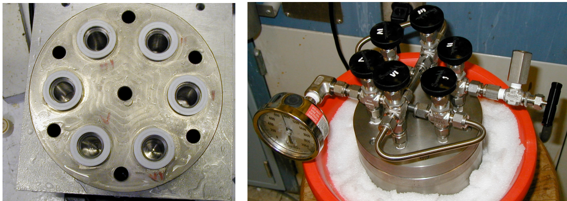
Figure S1. Six-well high pressure reactor.

Figure S1). The reactor was pressurized to 900 psi with CO and heated to 60 °C with stirring. The temperature was held constant for 6 h, at which point the reactor was submerged in dry ice for 15 min. After careful venting of excess CO, the glass vial was removed and product yield determined by ^1\text{H} NMR. In general, pure lactones from most substrates could be isolated by careful vacuum distillation.