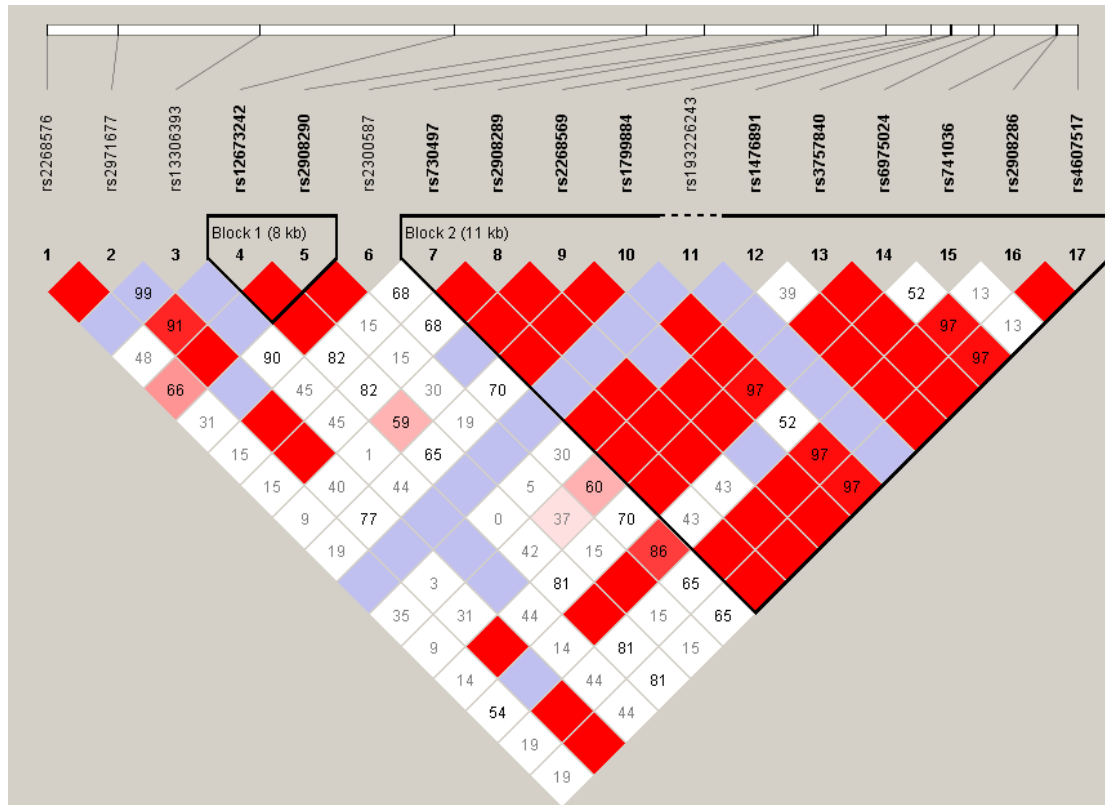
Figure S2. LD plot between rs13306393 and the SNPs which were reported associated with diabetes or diabetes-related traits in Chinese.

The genotype data across the GCK gene (GRCh37: 1000G_chr7_44183870-44229022) for Han Chinese were extracted from the 1000Genomes database