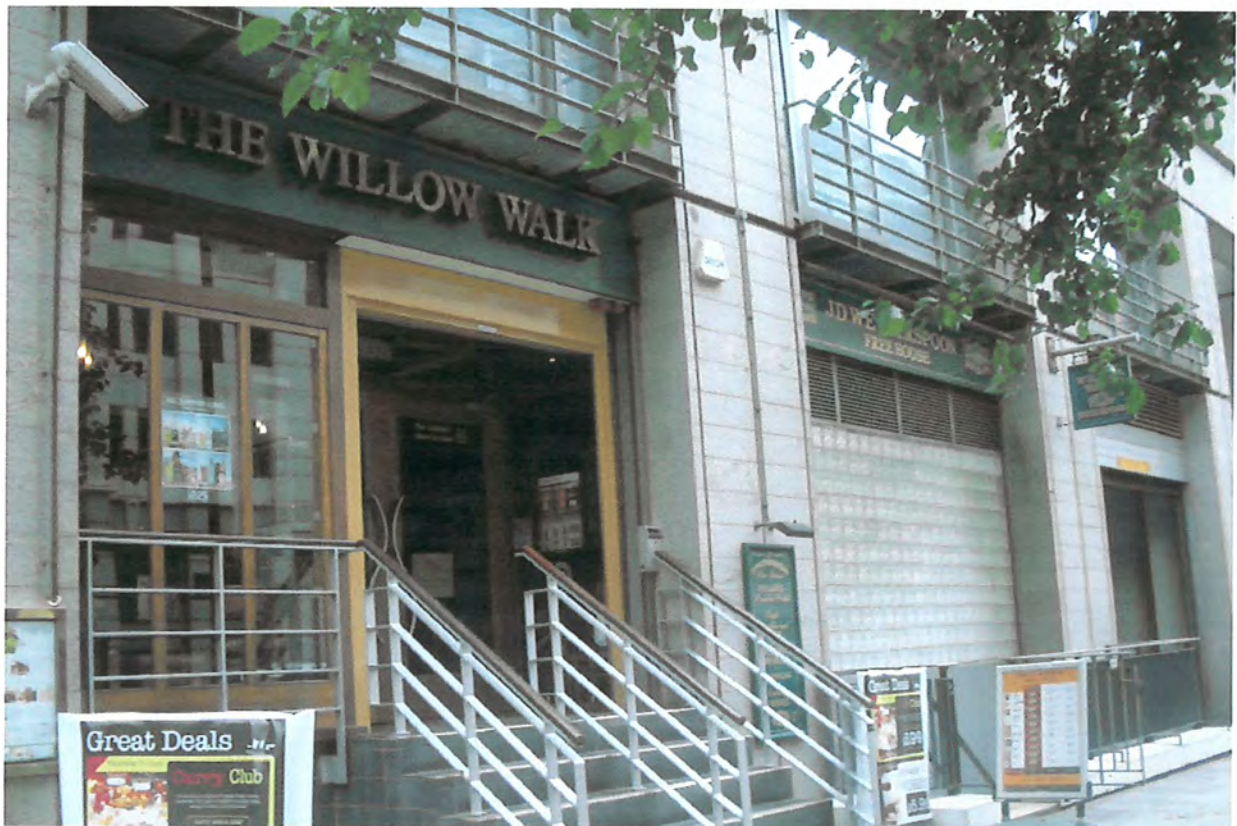
Secondary entrance on Vauxhall Bridge Rd