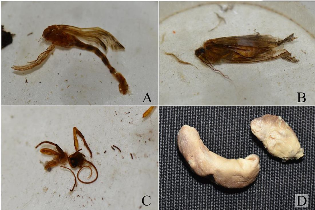
Figure S2. Diet of G. rubromaculatus : (A) debris of moth picked up from the excrements of Y2; (B) vomited by Y3 after caught, identified as a female Sideridis sp. ; (C) debris of moth from the excrements of Y5; (D) undigested neonate zokors ( Eospalax fontanierii ) discovered in the stomach of NWIPB 630064.