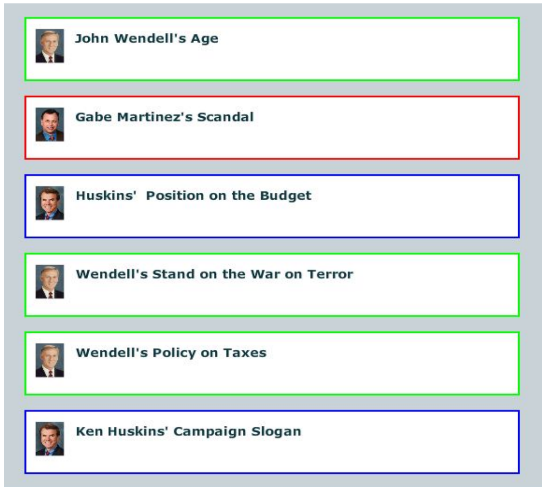
Figure 1: Information Board without Social Cues