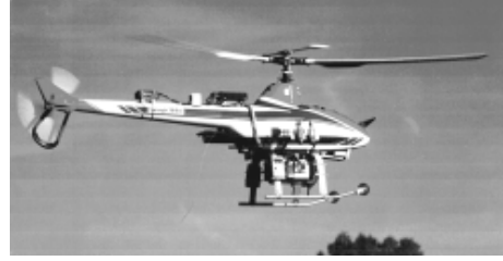
Fig. 1. The CMU Yamaha R50 helicopter in autonomous flight.

where \mathcal{M} denotes the discrete class of models to be estimated from the data. The second distribution in each summation is just the posterior model M' ; that is, the distribution over Markov models conditioned on the observed data and the transition from X_0 to X_1 . But then the final equation shows that p(X_2, X_1 | X_0, \mathcal{T}) is just another one-step distribution from the new distribution of models P(M') , simply the learned model under the old data and the new observed transition.