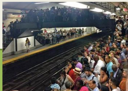
(New York subway, 2020)