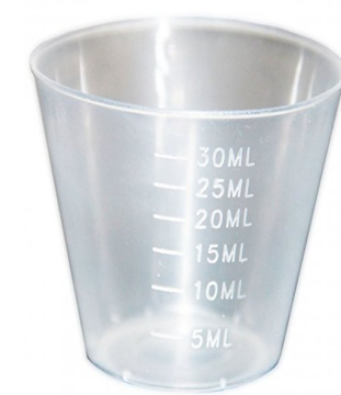
15 mL cup (CUP)