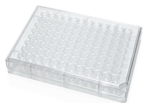
96-well plate (96WP)