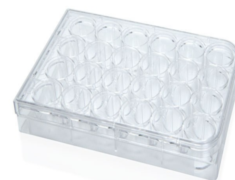
24-well plate (24WP)