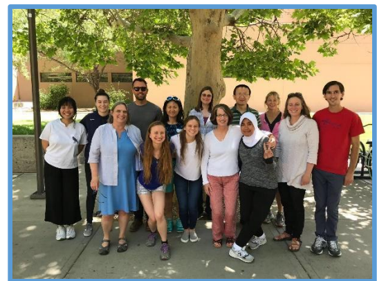
Summer 2018 EDI Fellows and Instructors