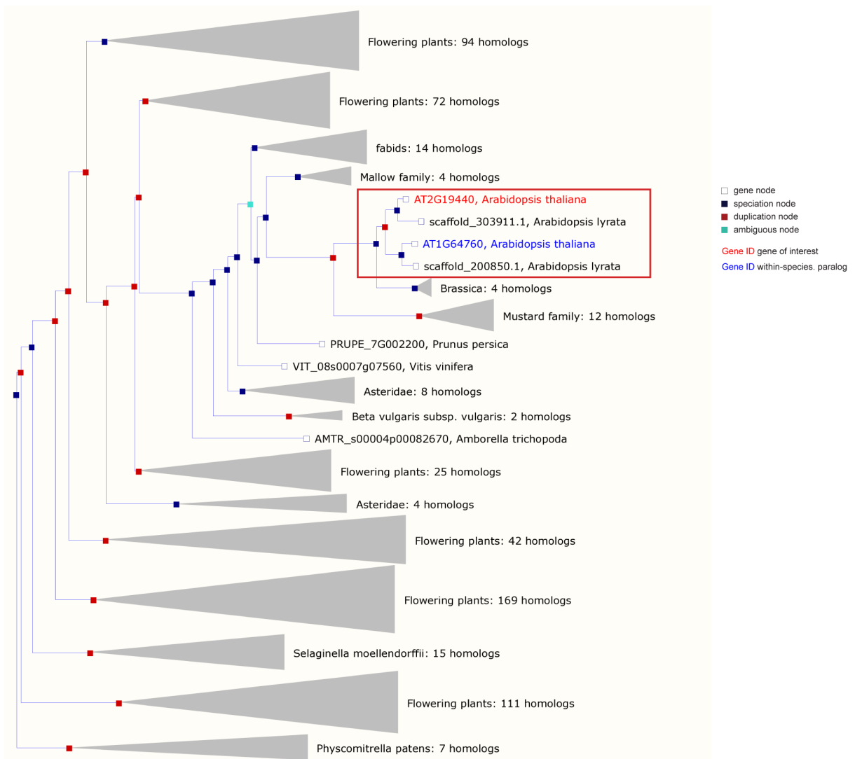
12 Fig. S2. Evolutionary history of ZET (AT1G64760) and ZETH (AT2G19440). 13 Phylogenetic tree showing the evolution of the ZET and its closest homolog (ZETH). The 14 tree shows that duplication is specific to Arabidopsis and it is not present in any other 15 Brassicaceae members. This phylogenetic analysis is adapted from the source: 16 http://ensembl.gamene.org . Full version of the tree is available at https://bit.ly/2Cx1EWn . 17