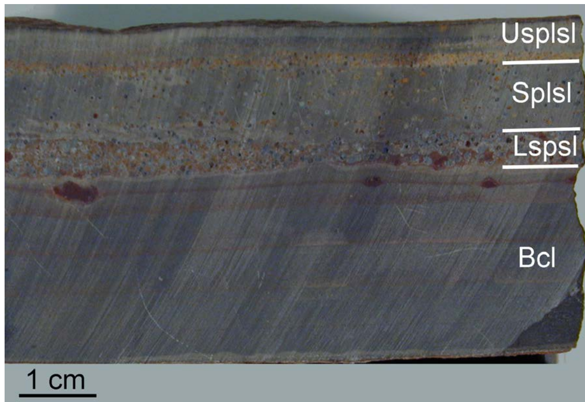
Figure DR1. Photograph of a sawn surface of Bee Gorge sample 96714A showing stratigraphic subdivisions. The sample is from the Tom Price site (Fig. 1). The basal carbonate lutite (Bcl) context layer is sharply overlain by the Bee Gorge spherule layer (BGSL). The BGSL consists of the lowermost spherule-rich sublayer (Lsplsl) subdivision, the spherule-bearing lutite sublayer (Splsl) subdivision, and the upper spherule/lutite sublayers (Usplsl) subdivision. The white line segments show the boundaries of the subdivisions. The four stratigraphic subdivisions were processed separately (see Methods in Data Repository). For each subdivision, the heavy mineral assemblage is given in Table DR6. \text{TiO}_2\text{-II} -bearing grains were found only in the Usplsl subdivision (Table 1).