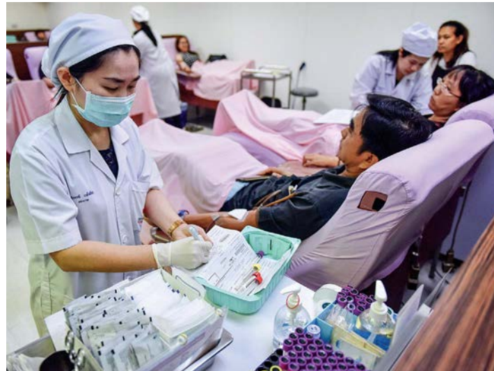
Bangkok, Thailand. A nurse keeps records of a blood donor at the Thai National Blood Centre on 14 June 2017.

tions presumably reflect differentials in income inequality, commitment to public health infrastructure, and the quality and reach of human resources for health. The WHO and World Bank also offer multiple measures of health spending-related financial hardship in assessing UHC, which do not increase monotonically with increasing income, health spending per capita, or coverage of health services. Rather, catastrophic health expenditures