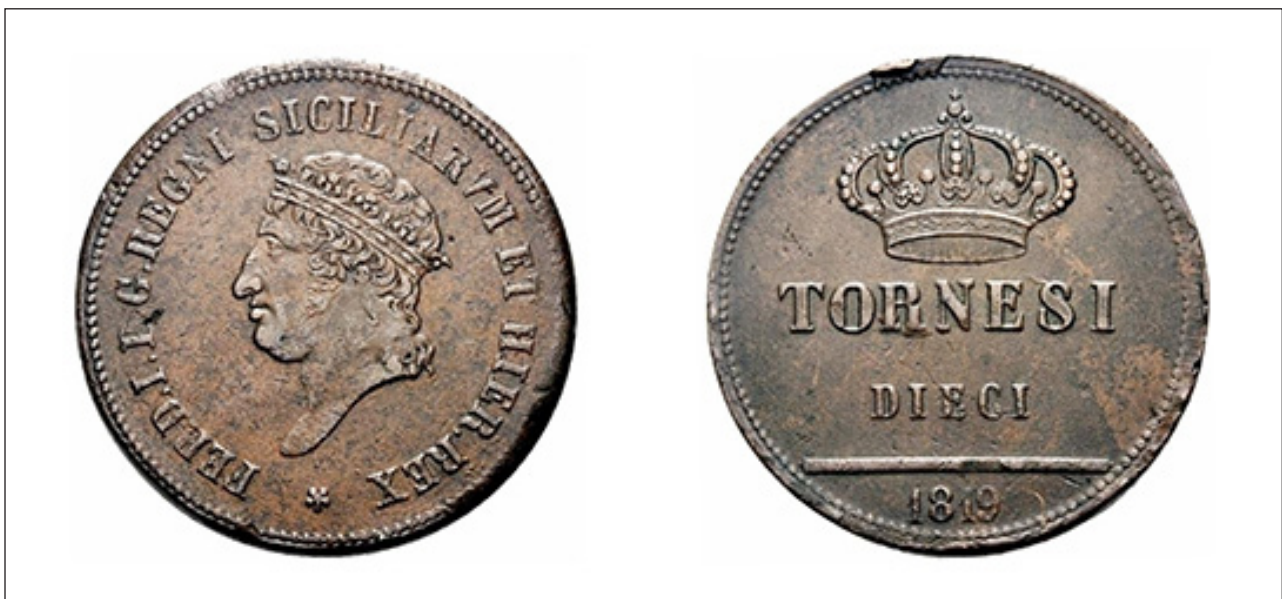
Fig. 2: Copper coin (10 tornesi, 1819), showing Ferdinand I, King of the Two Sicilies.

Further to the north of Adrano, the town of Bronte and its surrounding territory also have extensive archaeological potential. As later surveys and excavations have demonstrated, the area had numbers of sites dating from proto-history to the late Roman period. For instance, in 1904–06 Paolo Orsi found Roman baths and mosaics at Maniace, dating to the AD fourth century (Orsi 1905: 445, 1907: 497; Spigo 1985: 198–200; Consoli 1988–1989: 74–79). Furthermore, we also know that ancient tombs and archaeological materials, dating from early Greek until Roman periods, were found in the town of Giarre (especially in the so-called Contrada Coste) in the twentieth century (Privitera 1990: 121–123).