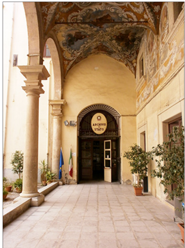
Fig. 1: The State Archive of Palermo ( Archivio di Stato di Palermo ).

artefacts, and of antiquarianism, in the early nineteenth-century, in Sicily. Second, they report on the discovery of ancient coins, which can be linked to a coin hoard. Third, they provide fascinating insights into the bureaucratic