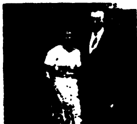
Snap from the family album: Freda and Gough Whitlam in 1970 before he became PM.

Page 36, please WOMAN'S DAY, March 28, 1977 17