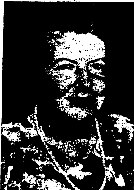
• Miss Whitlam

"I believe in chastity before marriage. I don't gamble, don't drink, don't swear—complete wowser, I am; but I don't get pernicious about it, although I abide strongly by my beliefs.