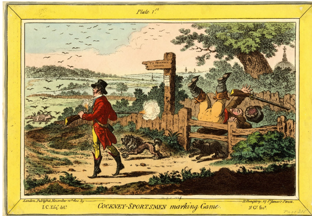
( Cockney-Sportsmen by James Gillray 1800.)

Gillray's painting from the beginning of the century gives a visual representation of the cockney sportsman stereotype. The cockney character in the foreground is dressed in the latest London fashions, consisting of elegant finery obviously unsuitable for the countryside. He has a gormless expression, his over-coiffured dog has already frightened off the birds and the cockney sportsman's gun is pointing the wrong way, having already shot his sporting colleague. The cockney in Gillray's painting is the over-privileged urbanite, who, whilst fully abreast of the latest cosmopolitan fashions, lacks practical skills suited to the outdoor life. In the press of the late 1820s and early 1830s, there is a contradictory mixture of references to cockneys and cockney dialect. The references to cockneys in newspapers and periodicals reflected the different meanings of the word still in use. Often, the term is used simply to refer to all London residents, for example in the extract from a literature review of 'History and Survey of the Cities of London and Westminster. Part 4' in The Satirist; or, the Censor of the Times , which states; 'The mass of information here collected will, we should think, astonish the most erudite cockney, and gratify the most ardent lover of research' (1832: