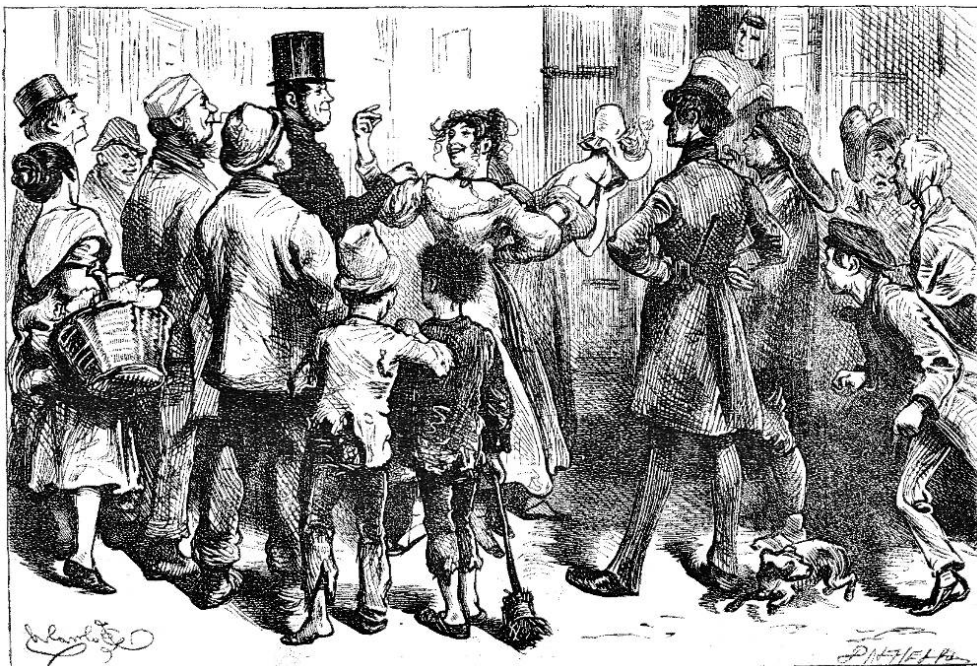
(The Prisoners' Van by Fred Barnard, wood-engraving, 1876)