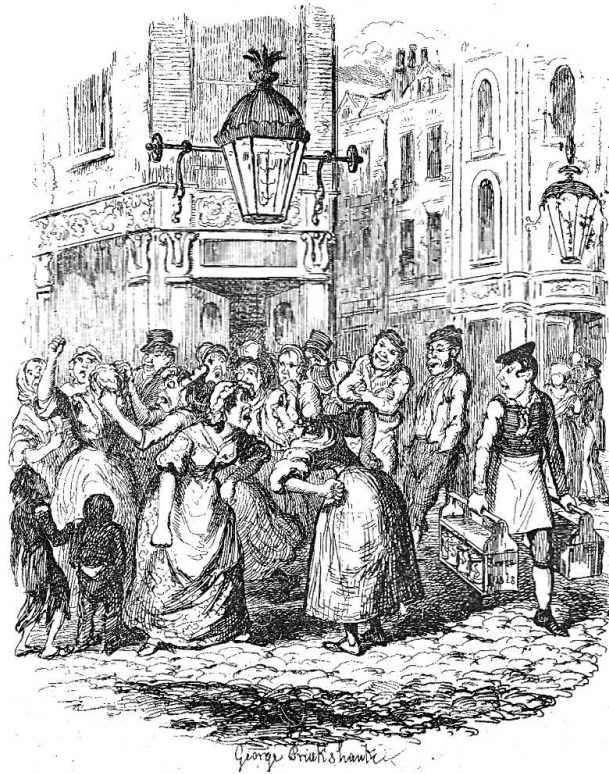
Seven Dials by George Cruikshank, 1839

In Dickens's 'Seven Dials' sketch, the screeching cockney voices of two drunken women fighting in the street serve as an auditory clue to the depravity of the neighbourhood, with its 'dirty, straggling houses' and 'dirty men, filthy women, squalid children, fluttering shuttlecocks, noisy battledores, reeking pipes, bad fruit, more than doubtful oysters, attenuated cats, depressed dogs, and anatomical fowls' ( Sketches by Boz : 94). Their language contains a density of dialectal features: