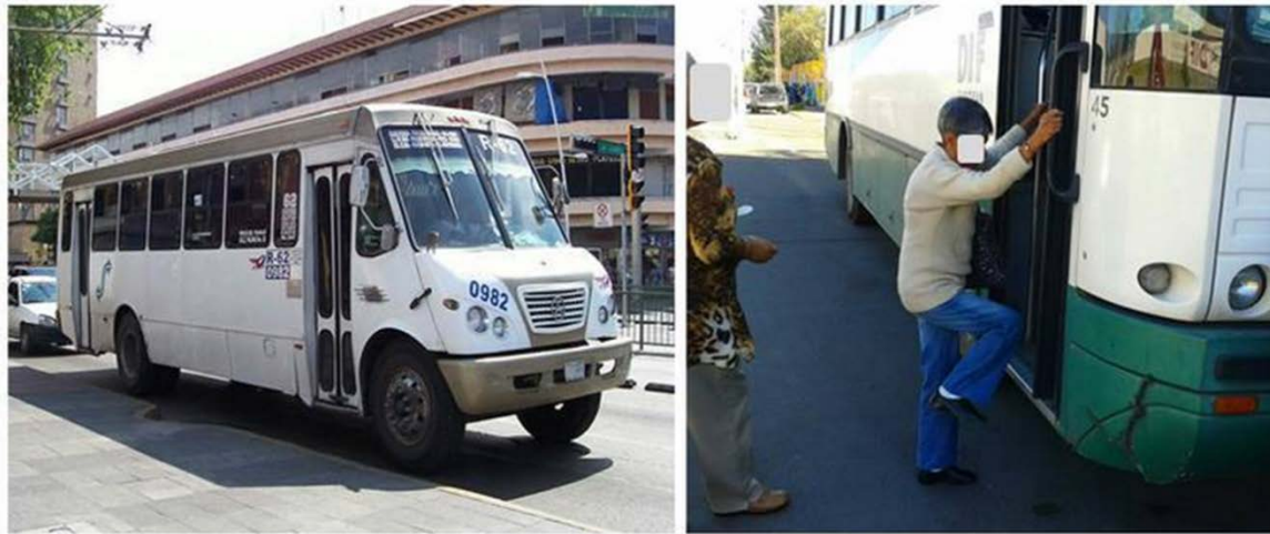
Fig 3 The buses were built on converted truck chassis

Due to buses being built on truck chassis, they all had high passenger platforms, no ability to lower the floor of the bus, and manual transmission. The handrails were generally placed horizontally on both sides of the gangway at a height of approximately of 175 centimetres. There were vertical handrails only near to the front and rear door. Most of the buses had a single bell placed on the vertical handrail close to the rear door at a height of approximately of 170 centimetres. The buses were designed so that passengers boarded at the front door and exited through the rear.