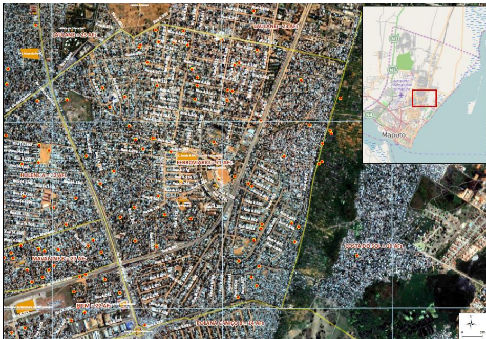
Figure 2. Example of the maps showing the specific points per bairro.

The bairro -specific percentage of how many systems can be expected to fill up was weighed together with the amount of population per bairro , distributing the points over entire Maputo, but being able to draw conclusions for each neighborhood and allowing to link the collected data to previously collected bairro -specific data.