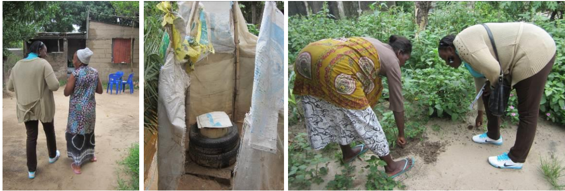
Photograph 1. Interviews, facility inspection and estimation of septic tank size as part of the field work

As planned, the rainy season provided difficulties in accessing some of the flooded areas. A more than reasonable amount of this time further had to be dedicated to identify the households where information about upfilling systems could actually be collected. Also the determination of the size of the facility provided difficulties and enumerators had to be send back to the field to correct unrealistic values (Photograph 1).