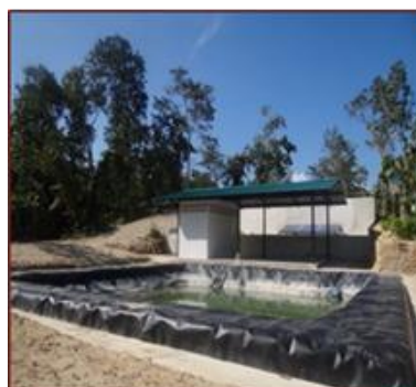
Figure 2. Effluent storage pond