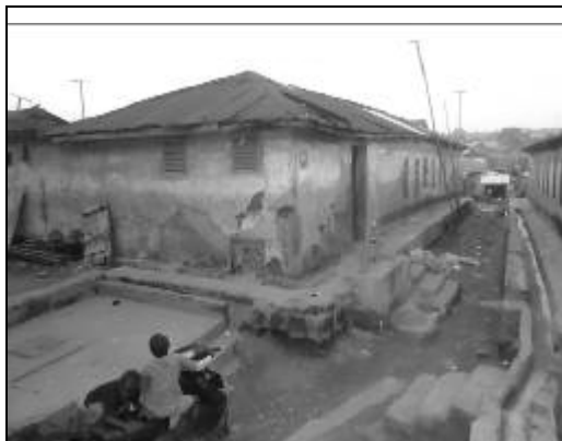
Figure 1. Compound house and street in Oforikrom

In the low-income areas of Kumasi, the most common form of habitation is ‘compound housing’: multi-room dwellings where a number of households live together, typically around a central courtyard, and often sharing the same bathroom, kitchen and common space (see figures 1 and 2). There are few statistics on sanitation facilities specific to compound housing - particularly in the target areas for this intervention - but the data available indicates that the problem of inadequate sanitation is pronounced for compound residents. For example, a field survey conducted in Kumasi in 2010 found that only 19% of compound houses had access to adequate sanitation: this represents a huge disparity with people living in other types of housing, of whom 73% had access to adequate sanitation (UN-HABITAT 2011, 47).