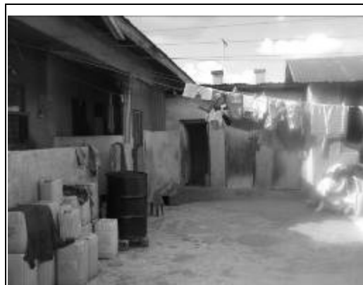
Figure 2. Compound courtyard in Ayigya Zongo