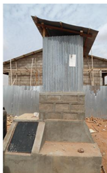
Figure 1. Schematic view of a UDDT