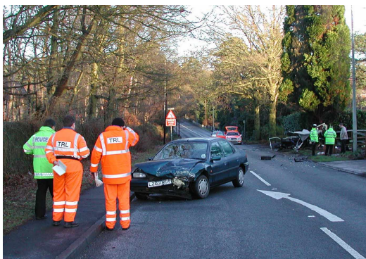
Figure 3. The TRL Investigation Team in action

The Transport Research Laboratory (TRL) are covering the Thames Valley region in the South East.