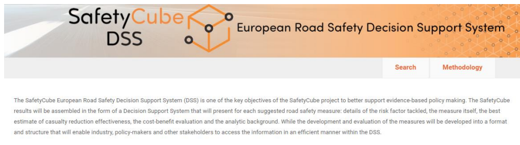
Figure 4: Overview of the Main Menu and entry points of the DSS.

The Home Page (Level 0), provides a general description of the system and enables an initial selection of the element of interest (e.g. risk factor or measure, via one of the entry points). The main menu “Method” provides basic information about SafetyCube and the DSS, as well as background information, resources and methodology, including extensive glossary.