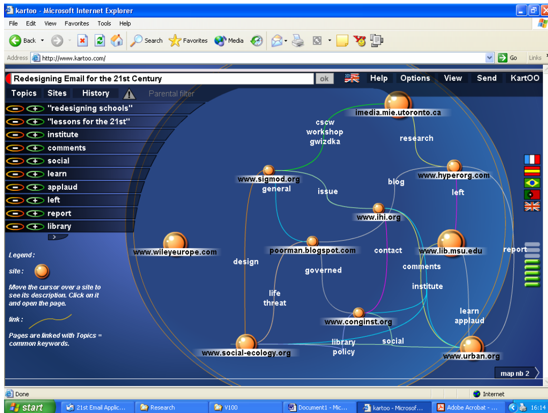
Figure 2 – Screen Shot from Kartoo.com

The keywords on the lines give more information about the link between the spheres. By clicking on the sphere, contact details of the knowledge holder will be shown to the end user querying the system. The user querying the system can then contact the knowledge holder to increase their knowledge about a specific area. Again, the success of the application depends on depicting keywords from an email and the willingness of the sender to share those keywords with the community.