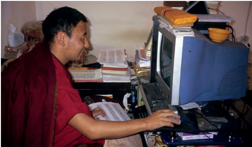
Figure 1 Tibetan monk typing a Buddhist text into a computer. In recent years, CDs have become part of Tibetan Buddhist book culture, revealing different temporalities within “modernity”.