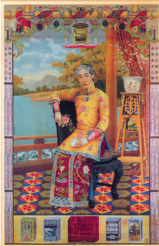
Figure 3 An advertisement for cigarettes. Such advertisements were called “calendar posters” (yuefenpai) because they included a calendar, in this case for the year 1918. Like other examples of the same genre, this one juxtaposes a Western-style Gregorian calendar and a Chinese-style lunisolar calendar, pointing to the often uneasy coexistence of time-honoured, “local” and seemingly more “modern” and “global” forms of conceptualising time.