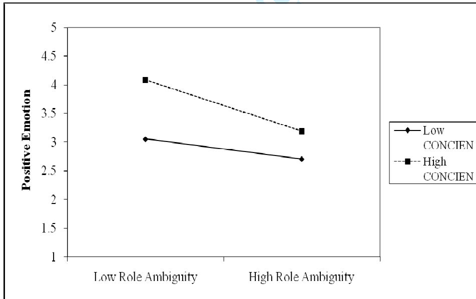
Figure 3. Conscientiousness (CONCIEN) moderates the Role Ambiguity –Positive Emotion Relation