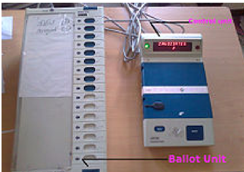
Figure 2 The Indian EVM.

The Indian EVM consists of a ballot and a control unit, connected by a 5-meter cable. Prior to the election day, each key on the ballot unit is marked with the name of a candidate and the symbol of their party. Recognition by symbols is particularly important, as India has a high illiteracy rate amounting to 25.6%, particularly so in the rural and tribal areas. The feature that sets the Indian design apart from other EVMs is that the software is provided as firmware, meaning that it is encoded in the EVM's EPROM (Erasable Programmable Read-Only Memory). EVMs are used for both the voting and the counting phases. Votes are cast and stored within the machine itself, which is then brought to counting centres where votes from the machines are aggregated and tabulated.