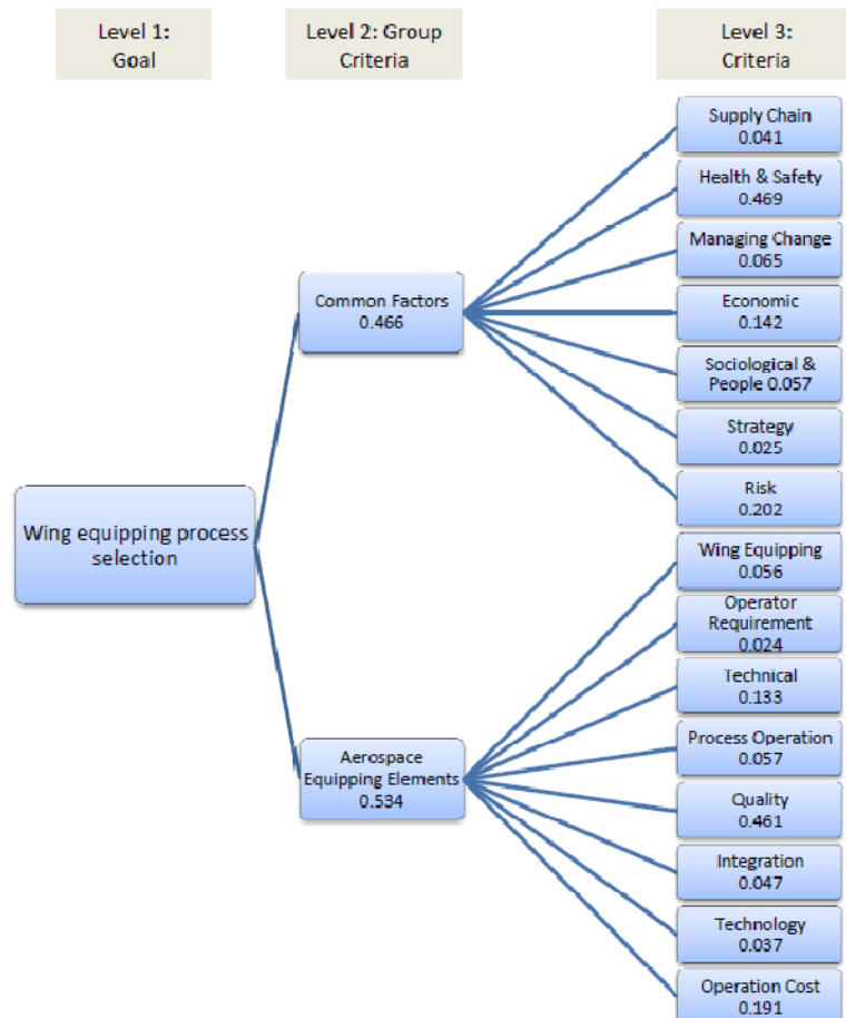
Figure 3 : Hierarchy with priority values

Table 6 illustrates the results of evaluating risk with each alternative. The table suggests that photogrammetry is the safest solution as the decision-makers view was that the overall risk of injury is low. This is a result of the reflective targets placed on the wing within reach of the operator. The laser tracker received the lowest risk rating with 0.236, the group agreed this was due to the risk of injury from the laser, constant movement of the reflective targets and weight of the equipment.