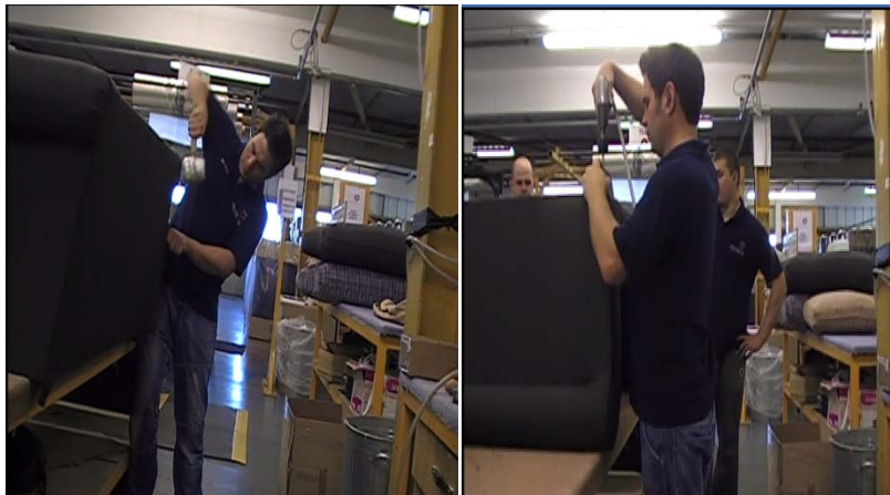
Figure 3. Recording individual's capabilities and behaviors performing manual assembly tasks

The HADRIAN database contains joint range of motion data for many older people and evidence shows that age is responsible for a significant decrease in joint range of motion values, especially for arm abduction and wrist flexion. Using these preliminary findings, designers can generate the same kind of scenarios where they can validate these findings by using joint mobility data of older individuals. The HADRIAN design exclusion process can, for example, give feedback that individual 10, aged 55 is unable to perform this assembly task because of joint