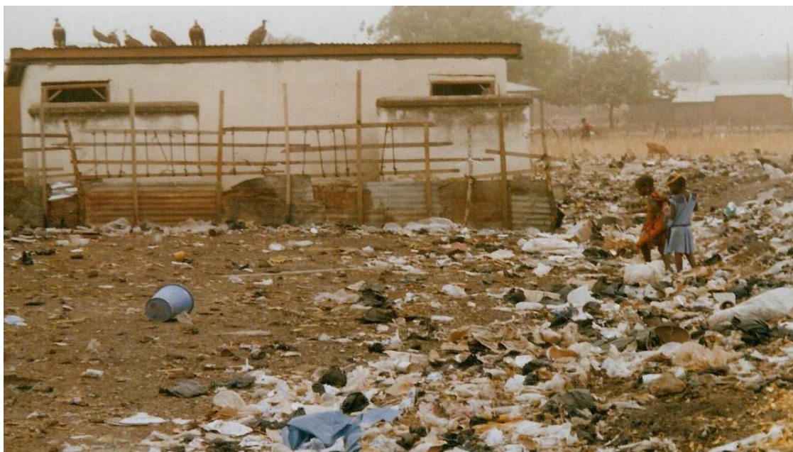
Photograph 4: A typical KVIP in Bawku serving as a garbage dump, located adjacently to 2 wells

The survey revealed that 89.2% of the population in Bawku East District uses the immediate environment around toilets as refuse dumps and 90.4% of the respondents percept that this phenomenon contributes to breeding of rodents and other household pests. Unexpectedly, 64.7% of the population viewed that the toilets were located less than 50m closer to water wells while 93.4% of those interviewed opinionated that toilets located closer to wells could contribute significantly to groundwater pollution contrary to the perceptions of a smaller section of the population (6.6%) in Bawku East district.