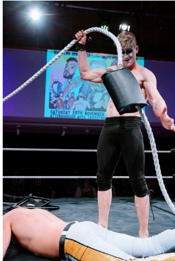
Figure 62: Then with the referee out of action, dismantles the ring ropes to use as a weapon.

In terms of understanding the success of his matches with Dynamite, Hart notes how they had a shared capacity to ‘visualise a match way before we ever did it’ (Hart, 2007, p.66). Due to the frequency with which matches take place, especially in the era that Hart worked, collaborations were strengthened through repetition. ‘Working’ Dynamite once again, this time in the UK, Hart recalls a dramatic end sequence to their match. It describes multiple intersecting storytelling techniques, which require unpacking.