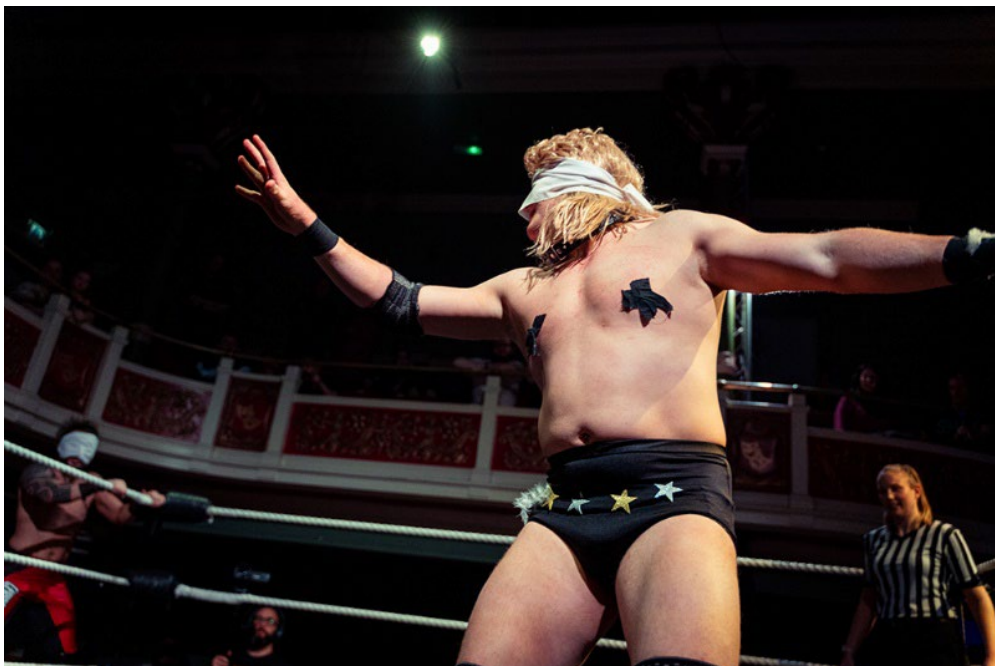
Figure 9: Gene Munny working 'blindfolded' in a 'gimmick' match, here 'work' is used for comedic effect.