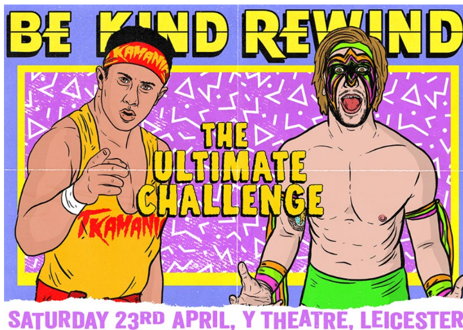
Figure 43: Match artwork, Wrestling Resurgence.

Attack has had an enduring influence on my own approach to wrestling storytelling, with parody of wrestling and popular culture a reoccurring motif in Wrestling Resurgence. The use of parody in relation to wrestler gimmick is undoubtedly a way of making wrestling entertaining, and as a prevalent, and often creative mode of storytelling, it warrants attention. However, in my estimation it can also offer strategies for wrestlers and wrestling companies to critique wrestling and the wider culture it inhabits. The specific example I have highlighted from Wrestling Resurgence, does both these things. Paul Booth, citing Rose (1993, p.37), notes how ‘as cultural critique, parody intertextually references the pantheon of texts that make up our mediated culture’ (Booth, 2014, p.398). In terms of wrestling storytelling, with a culture and history that is both long and detailed, there is near-limitless scope for parody across matches, events and in the presentation of individual characters.