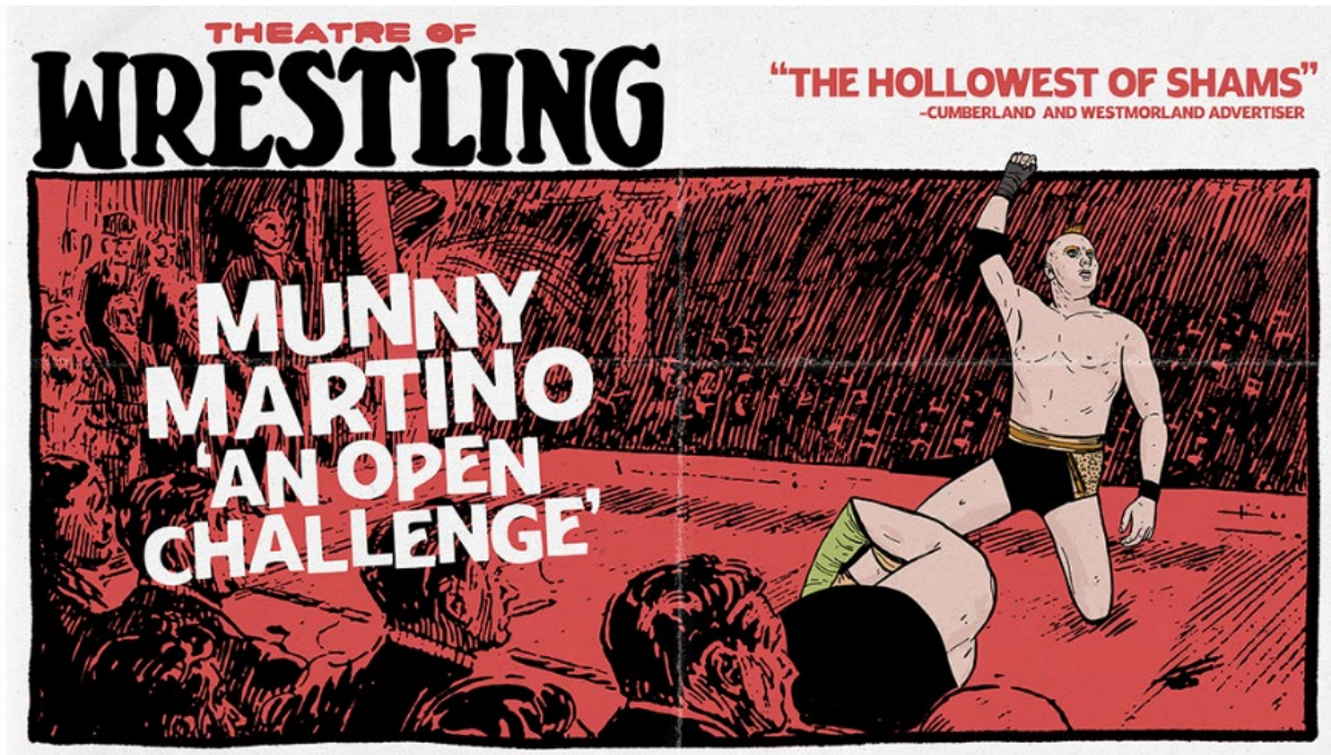
Figure 20: 'Theatre of Wrestling' film artwork

The second performance in the 'Theatre of Wrestling' anthology is inspired by wrestling history, adopting a formula that persists in the modern era – an open challenge match. While the exact origins of the challenge scenario are difficult to trace precisely, on the music hall stage Litherland locates its arrival to around the 1890s and early 1900s. He notes that 'challenge matches were a feature of earlier fairground booths' and remained popular well into the twentieth century (2018, p.57). The open challenge is part-trick, part-storytelling, used for various purposes from the obviously commercial, such as fleecing unwitting audience members, through to employment as a promotional tactic, to build interest and celebrity. In today's wrestling, the open challenge now primarily serves a storytelling function, for example a way of introducing or bringing back a character to a promotion or to create a new angle.