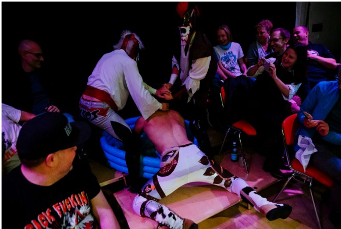
Figure 13: The villainous Lykos Gym ‘drown’ Charles Crowley in a paddling pool filled with plastic balls.

One of the most detailed comparisons Roland Barthes offers is between the body of the wrestler and those of the Italian theatrical tradition Commedia dell'arte . Specifically, how the bodies perform a clearly defined moral role in each match-story, such as the hero or the villain. 34 In Barthes's estimation, wrestlers 'have a physique as peremptory as those of the characters of the Commedia dell'arte , who display in advance, in their costumes and attitudes, the future contents of their parts' (2005, p.25). Like the Commedia dell'arte troupes that toured Europe over 200 years ago, wrestling companies use well-established and endlessly repeatable scenario templates and character types to tell their stories (Peacock, 2013, p.59). This reading of wrestling in relation to Commedia dell'arte has, for the most part, largely remained unexplored since Barthes's writing. Claire Warden for example suggests in relation to this aspect of Barthes's analysis that 'such clear-cut characterisation feels faintly old-fashioned' (2018, p.871). While there is certainly an element of truth to this in terms