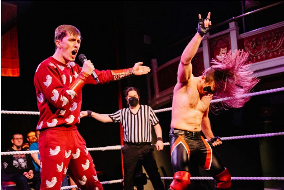
Figure 39: Wrestling Resurgence guest ring announcer Mad Kurt introduces North American wrestler Warhorse. The Warhorse performance persona is both a heavy metal gimmick and an ode to the wrestling music gimmicks of the past.

Typically, 'gimmick' is wrestling shorthand for an amalgam of character and persona, but it can also describe anything 'worked' or fake within wrestling performance, i.e., a 'gimmicked' table, is one structurally compromised to allow it to break more easily when a wrestler is propelled onto it. In describing what a wrestler represents within a wrestling text (be that an event, a match, a television show), gimmick is the most used analytic frame for character and/or persona. Despite its limitations, given its widespread use within the industry (and its implicit use within scholarship), before moving to a more complex approach that goes beyond it, there is value in fully conceptualising this term. 'Gimmick' can relate to the visual motif adopted by a wrestler, for example, a wrestler's costume (in ring and during entrance), hair and makeup, entrance music (sometimes video), they may also use props that they carry with them to ring. 'Gimmick' can also be attached to physical characteristics, including body shape and type, how the wrestler moves (such as walking around the ring) and their