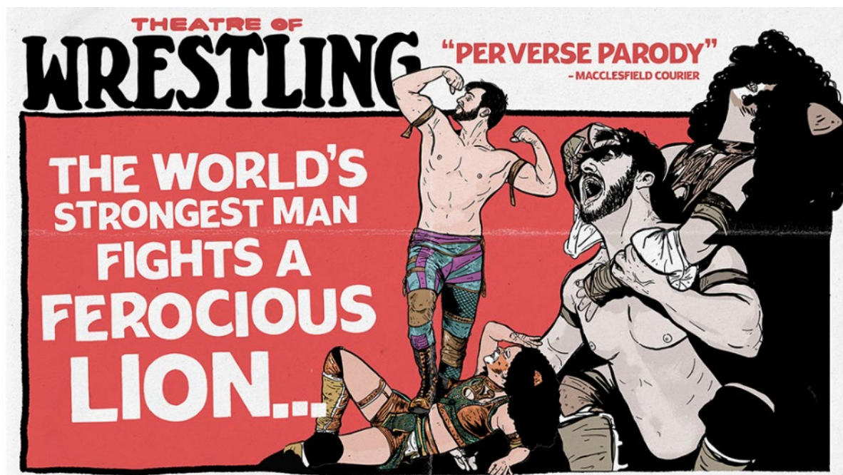
Figure 25: 'Theatre of Wrestling' film artwork.