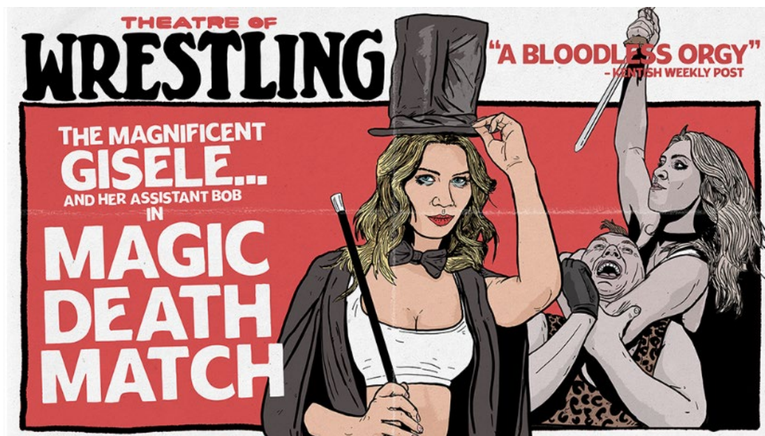
Figure 16: 'Theatre of Wrestling' film artwork.