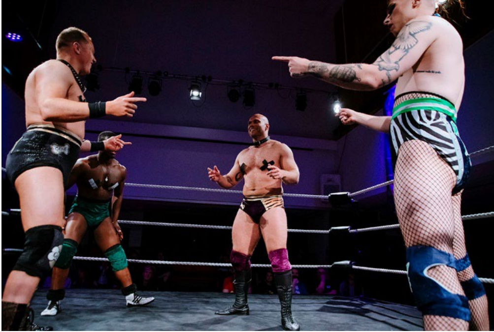
Figure 40: 'Gimmick' confusion as four different versions of Gene Munny share the same ring.