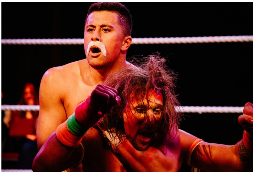
Figure 44: TK Cooper (as Hulk Hogan) locks in a headlock on Chuck Mambo (as The Ultimate Warrior).

received as much attention, at least not in a scholarly sense, they are no less troubling. The now late Warrior's own brand of bigotry appears by all accounts as indiscriminate as it is discriminatory, but it is his views on homosexuality that he is best known for. Warrior was a man described by the prominent wrestling journalist David Bixenspan as 'virulently homophobic' (Bixenspan, 2019, n.p.). Post-professional wrestling, after several enterprises that were equally as bizarre as they were unsuccessful 83 , Warrior rebranded as a conservative commentator, addressing a Young Republican event using homophobic language and sharing various anti-LGBTQIA+ beliefs (Rousseau, 2017, n.p.).