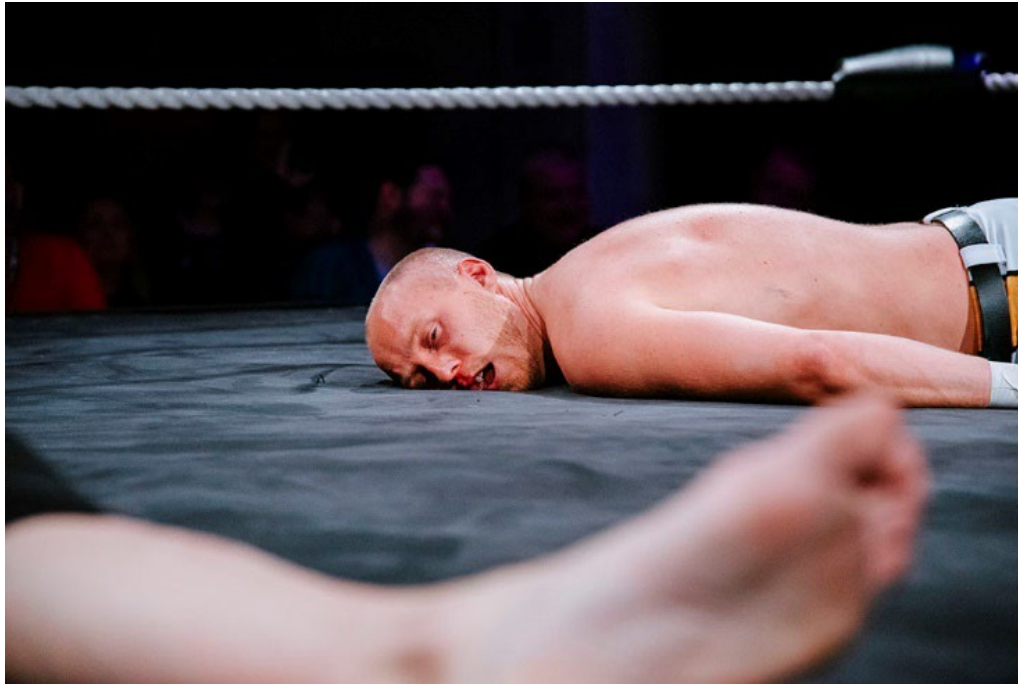
Figure 57: Unlike 'shoot' combat sports such as MMA or Boxing, in wrestling the fighters use time differently. Selling an action, by laying defenceless on the canvas, not only sells the offence, but it also creates time and space for the next move or sequence.

Barthes would no doubt argue that what mattered most was the obviousness of these moments described by Seagroatt. Here again, wrestling differs from 'shoot' sport. For example, Barthes notes that wrestling 'offers excessive gestures, exploited to the limit of their meaning' (2005, p.24). The comparison he creates is between judo and wrestling, but we could substitute judo for various sports. The crucial point is that they convey different experiences of time. In a Shoot sport, when an MMA fighter is struck to the ground and is still conscious, they must quickly assume a defensive position or risk further attack. However, in wrestling, the work commands that when taken to the ground the wrestler must sell immediately i.e., their first thought is not defence from further attack, it is to render obvious the effect of the move they have just received. The most obvious example of this is shown in figure 49, no conscious MMA fighter would lay down in this way, they would assume a defensive position to avoid or mitigate further attack. As Barthes puts it, the selling wrestler, 'fills the eyes of the spectators with the intolerable spectacle of his powerlessness' (2005, p.24). This difference in timing is not just a way to communicate the effect of moves to the audience, it also