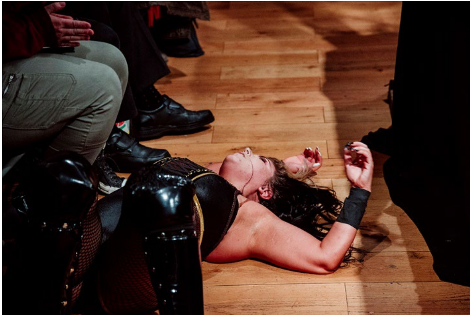
Figure 58: Wrestler takes her time to display the effects of an attack outside the ring, but also gather herself for the next part of the match.

enables wrestlers to progress the narrative of the match. 'Selling' time, to coin a phrase, creates space for moves to follow one another and for tension to build.