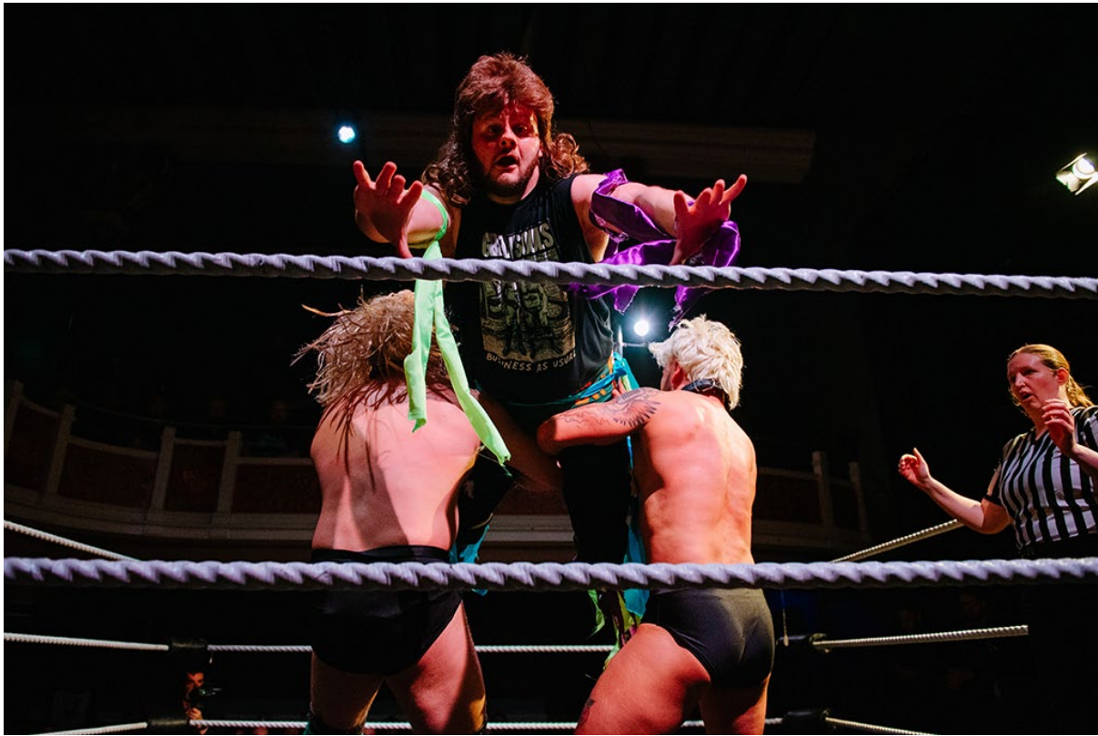
Figure 5: The Rocking Souls and Munnywood Blondes perform a wrestling homage to 1980s North American tag team wrestling. In a sense, matches like this retell stories from wrestling past.

cage matches and no disqualification bouts. This use of motif makes the match repeatable, but also varied, like the way folktales use different tale types.