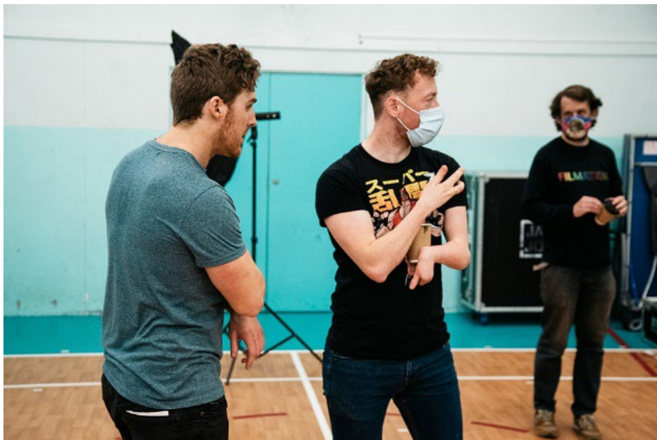
Figure 33: Myself in my capacity as Booker, backstage at the Y Theatre with a professional wrestler working on a Wrestling Resurgence project.

In a way, I have been preparing to be a wrestling booker my whole life. This is a story about my first experiences of booking. My first roster of professional wrestlers are four inches tall and made of plastic. However, in booking them many of the same principles that applied then, remain relevant. The wrestling events of my childhood take place in a toy ring, surrounded by cardboard stands, accessed by a homemade entrance ramp. The figures are replicas of the sport's great superstars: The