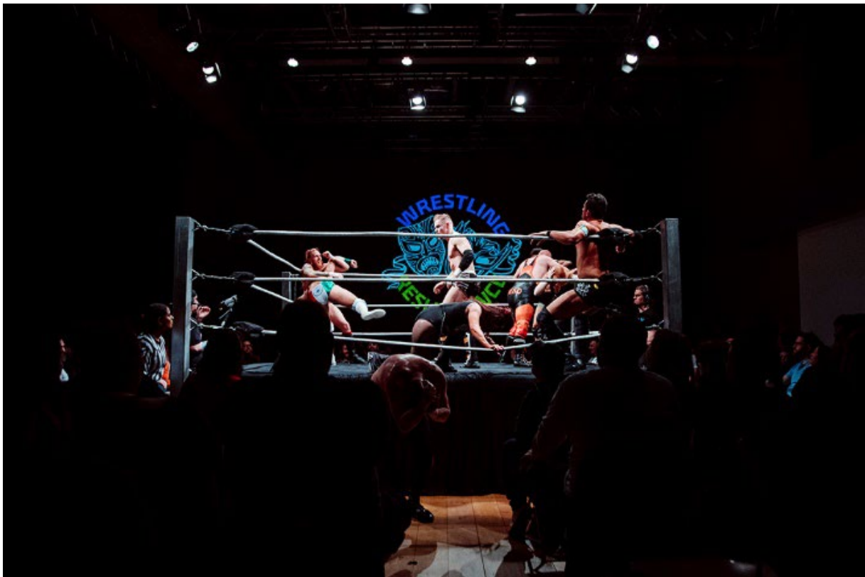
Figure 6: A Wrestling Resurgence live event at Nottingham Contemporary art gallery in March 2020

Unlike mainstream wrestling, where live events are recorded weekly for television and streaming and build toward bigger pay-per-view events, independent wrestling events are typically organised monthly or bi-monthly. Sam Ford notes how this is not the case for mainstream companies, where weekly television events act as the primary ‘narrative drivers’ with stories unfolding at a quicker pace and are typically concluding or reaching a climax at monthly Pay-Per-View (PPV) shows (Ford,