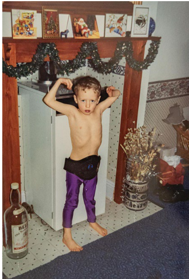
Figure 38: Myself, aged 5 in 1992, sporting Sting-inspired purple wrestling tights and a toy championship belt.

For Christmas, aged five, I asked for one thing. A wrestling costume inspired by my favourite wrestler, World Championship Wrestling's hero of the early 90s, Sting. I was overjoyed when my wish came true. I was the proud owner of a pair of purple leggings and a toy championship belt. Like the make-believe work of wrestling, I played out with action figures in my bedroom, wrestling was the dominant theme of my play with others, chiefly my long-suffering Dad, always a willing participant, despite his ambivalence to any wrestler other than the technically proficient British grappling Lord Steven Regal. In these moments of play, the living room of our family home in rural Wiltshire was transformed into a wrestling ring, with the door leading from the dining room acting as the entrance way. One on one play wrestling matches were common, but my favourite stipulation was always a