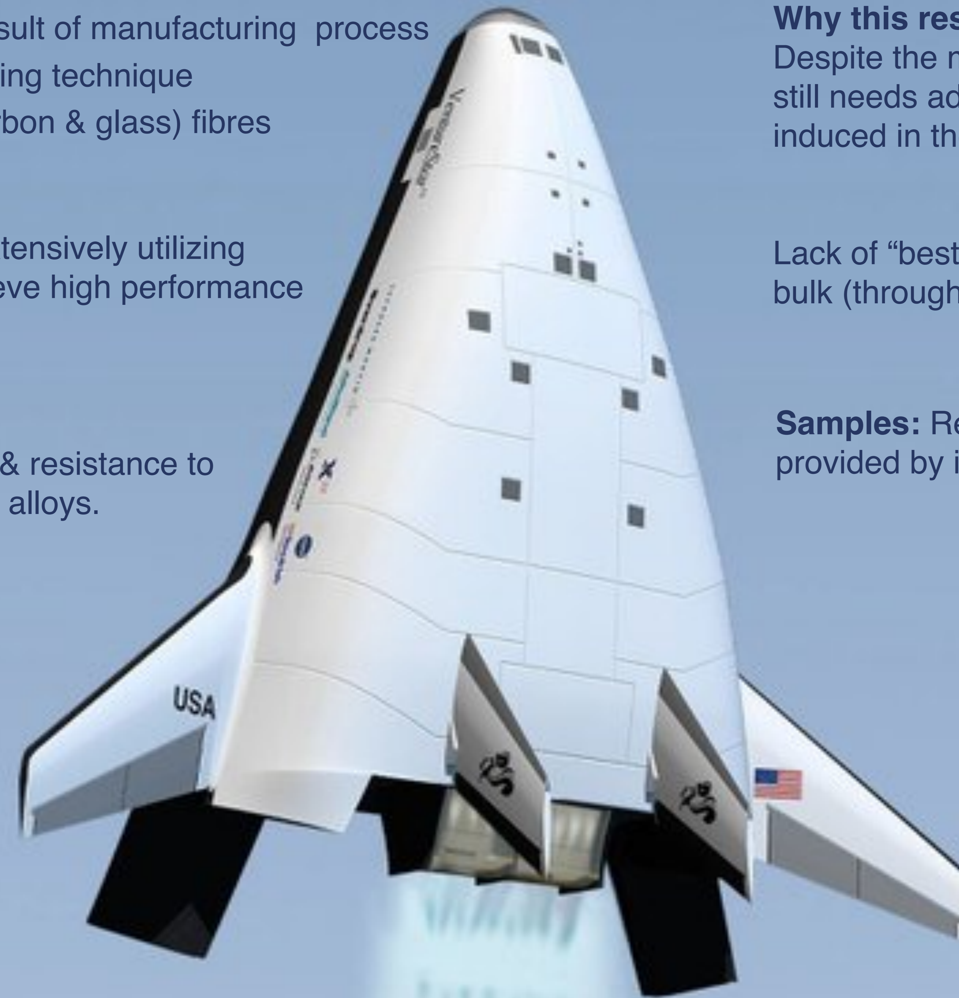
NASA X-33 Space Vehicle

Detrimental effect of residual stress in composite liquid hydrogen tank