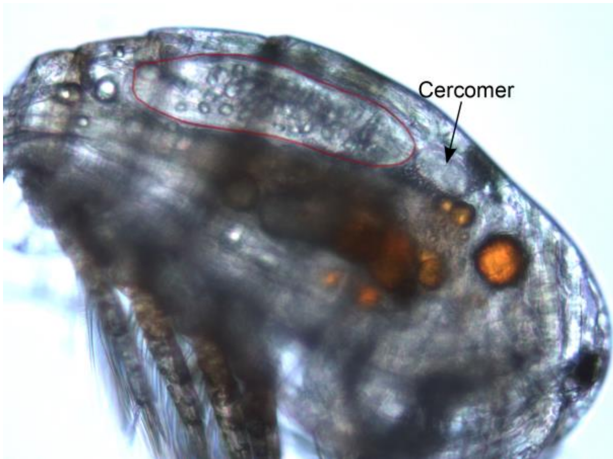
Figure S2: Macrocyclus albidus infected with Schistocephalus solidus . Red outline indicates area used to measure parasite size.