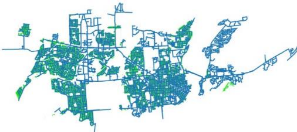
Figure 2. City of Kingston Water Distribution system