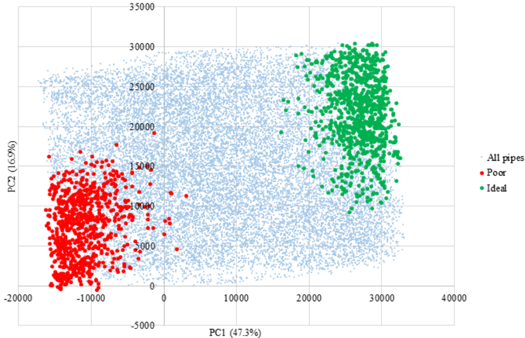
Figure 3. Bi-plot of pipes on PCs- Ideal versus poor pipes

Figure 3 shows the bi-plot of the pipes from the 17 systems. This figure shows the score of each pipes with regard to PC 1 and PC 2 . The poor and ideal pipes in terms of energy metrics are then highlighted in red and green respectively. An important point in this discussion would be gleaned from stacking Figures 2 and 3 together, as they are based on the same axes/PCs (different scales). In fact, doing so would clarify what hydraulic parameters in Figure 2 would drive pipes towards green or red pipes in Figure 3.