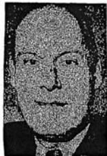
Jew, Nicholas Katzenbach, led troops to force Negroes into University of Alabama.