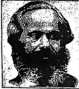
MARX Jewish Founder of Communism