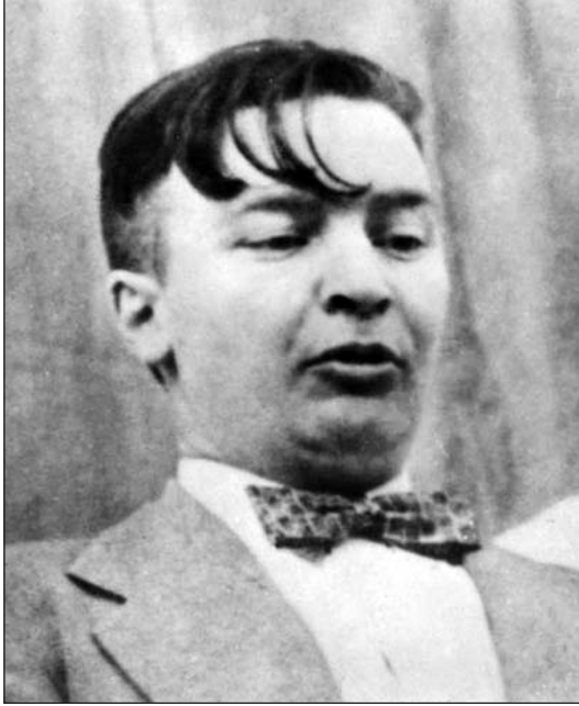
Fig. 1. Portrait of J. B. Stoner, undated.

ties of all citizens, the ACLU sued for the right of the National Socialist Party to march in Skokie. Jewish defense groups, reacting to grassroots pressure, filed suit to ban the march on the grounds that it would incite violence. Although the Supreme Court upheld the First Amendment rights of the National Socialists, the march through Skokie never actually took place. 7 While numerous scholars have analyzed the Skokie affair, hardly any have attempted to situate it within a broader historical narrative of civil rights groups' strategy on hate speech. The Stoner incident has received little attention but is historically significant since it occurred five years earlier than the events in Skokie and anticipated what would later prove an acrimonious debate over whether or not white racists were entitled to the protections of the First Amendment.