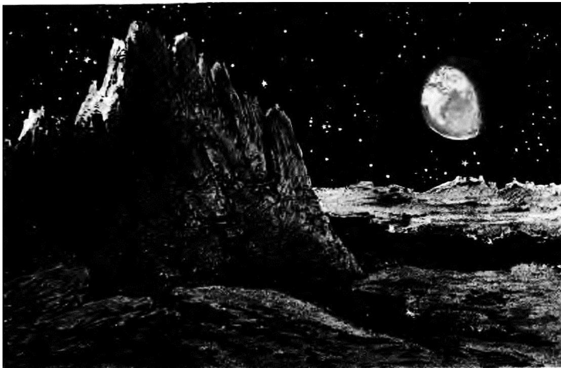
Figure 4 "Lunar Landscape Sunset", from Agnes Giberne's Sun, Moon, and Stars , 1880.

Giberne goes on to describe what can be seen from the surface of the moon and the striking features of the destination itself. She draws on established astronomical facts: the flame-like prominences on the sun, the black spots on its surface, how the sun lights the earth, the moon's atmosphere and its volcanic mountainous landscape (Fig. 4). But it is in her Among the Stars , that Giberne makes extended use of the cosmic journey. Here, she uses the theme of the cosmic voyage to describe the heavens to her readers through the eyes of a young boy called Ikon, who also flies through the solar system on "Wings of Imagination" (24). Giberne presents her readers with the experience of learning through the educational experience of her main protagonist, Ikon, who as a child is on the outside of scientific culture, just like the children and beginners her book is aimed towards. As well as disseminating astronomical knowledge, Giberne's text suggests that astronomy can be learnt from experts in the field – professional and amateur, male or female. Ikon is taught by a