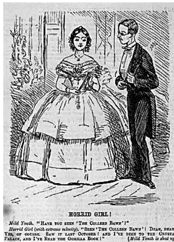
Figure 2 John Leech, "Horrid Girl!" from Punch , 1 June 1861.