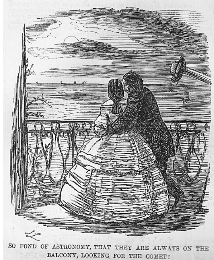
Figure 3 John Leech, “So Fond of Astronomy that they are always on the Balcony, Looking for the Comet!” from Punch , 2 October 1858.

“been to the Crystal Palace”, and read Paul B. Du Chaillu’s “Gorilla book!” 5 Watching the heavens could even be deemed to put propriety at risk, as the man’s hat covering the barrel of the telescope suggests in an 1858 Punch cartoon by John Leech titled, “So Fond of Astronomy, that they are always on the Balcony, Looking for the Comet” (Fig. 3). “A little smattering” of scientific knowledge was all that was considered needed by women. Writing to her brother Charles on 3 March 1833, Susan Darwin described how she could learn just enough knowledge of geology for her needs from cheap periodicals: