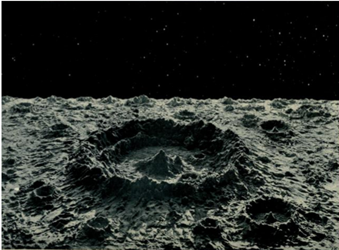
Figure 1 James Nasmyth, “Normal Lunar Crater”, Woodburytype from The Moon Considered as a Planet, a World, and a Satellite , 1874.