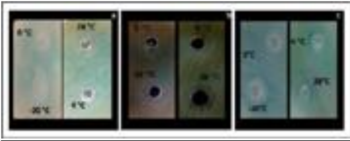
Figure S2. Qualitative screening images indicating QSI activity of NP formulation kept at different temperature conditions (a) after 2 months (b) after 4 months (c) after 8 months using E. coli MG4 reporter strain.