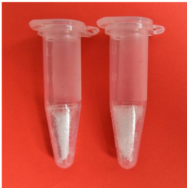
Supplementary figure 1. SQAd NPs samples after freeze-drying, using 5 % wt. sucrose (left) or 5 % wt. trehalose (right).