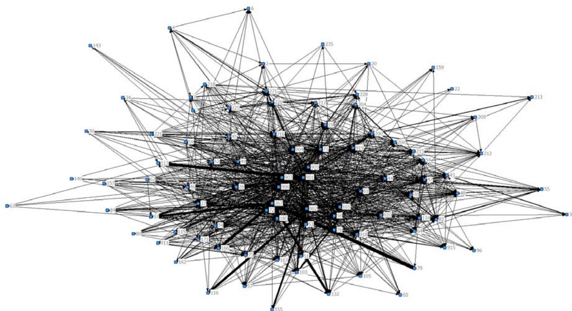
FIGURE A3: Network of patient transfer relations among hospitals in the region

Note: Each node (dot) represents one hospital and each tie (link) represents an existing collaborative patient transfer relation among node pairs. The dimension of ties is proportional to the number of transferred patients between hospitals. Hospitals' location is determined using a spring-embedding heuristic, multidimensional scaling algorithm, with proximity indicating the extent to which two hospitals are connected directly and indirectly through mutual partners (Borgatti, 2002).