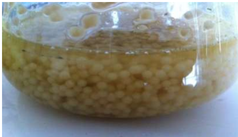
Figure S2. Broth culture of Aspergillus flavus used in the study