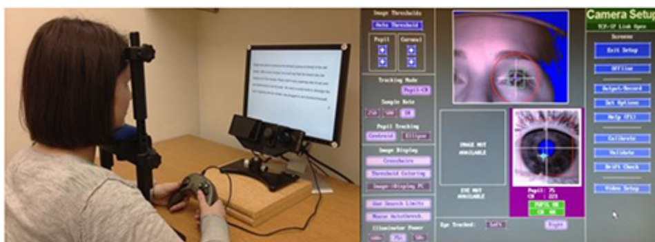
Figure 1. The left picture shows a participant positioned on the forehead/chin rest while looking at a computer display. The infrared light source and video camera are located beneath the display. The right picture shows the experimenter's display. The large image in the top frame shows the participant's face around the right eye (the eye being tracked) and the small image shows a close up of the right eye. The blue areas are areas of high infrared light reflection from the participant's hair (large image) and pupil (small image). The cross hairs over the eye identify the center of the pupil and the corneal reflection near the bottom of the pupil. Click here to view larger image.

The advantages of recording eye movements as opposed to reading times for an entire passage or sentence-by-sentence reading times can be seen in Figures 2 and 3 . For example, there are five fixations on the metaphor region ( Figure 2 ), three forward fixations and two regressive fixations, which reflect the reader reading through the metaphor to "doorway" and then returning (regressing) to "degree." In essence, the metaphor was read twice. This outcome would go unnoticed if only sentence reading times or overall reading times were measured. As a second example, Figure 3 shows that more time was spent reading the last word of the metaphor than the other three words in the metaphor, and that reading time was faster for familiar than unfamiliar metaphors for three of the four words in the metaphors. Measuring sentence-by-sentence reading times would indicate longer reading times for sentences containing familiar metaphors than unfamiliar metaphors, but it would be impossible to know if the extra reading time was distributed across all words in the metaphor or was confined to specific words, and how much time was spent on each word would be unknown. These two examples show the benefit of recording continuous, online reading behavior.