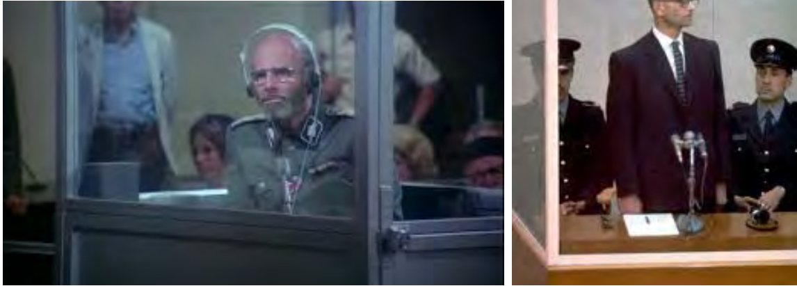
Still shot of Maximilian Schell as a boxed-in Adolf Karl Dorff in 1975's The Man in the Glass Booth (left); 1961 photograph of Adolf Eichmann in his real glass booth in a Jerusalem courtroom (right). 39

After Mossad captures Goldman and identifies him as their (Rankin/Kindler-esque) Nazi in hiding, using dental records as confirmation, Goldman is flown to Israel where the second half of the play takes place. Here, Goldman transforms himself from Jewish tycoon into Nazi Colonel Adolf Karl Dorff and incites his captors by refusing to disguise or repent for his actions. Mrs. Rosen, the Israeli prosecutor, deposes him, asking why “in the reports of the Einsatzgruppen I notice plain words do not occur: we have ‘final solution,’ ‘evacuation,’ and ‘special treatment,’ [while] on the other hand, in your reports, you always stated ‘extermination’ or ‘killing.’ Why is that?” The smug Dorff offers his maxim—“always call a spade a spade”—before going on to explain how “those euphemisms you speak of were best for keeping orders—they didn’t want the typists to get the message.... But in my case, I’m not here to tell you I didn’t enjoy it—I’m here to tell you I did. No clerk, Rosen! Issued my own orders, plotted my own plots, had a ball.” 40 Here and elsewhere, the figure of Goldman/Dorff seems to be fulfilling the implicit threat of Orson Welles’s “stranger” and its negative fantasy of duplicitous evil hiding in the “sacred