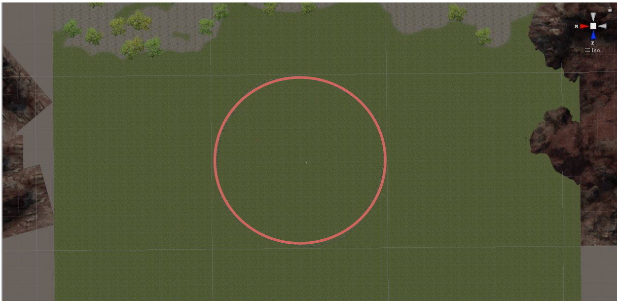
Figure 1: A bird's eye view of the distal maze, showing hills, trees, and mountains to the west, north, and east respectively. These distal cues are outside of the boundary and can only be seen but not reached.

this is a more realistic environment to navigate. The virtual maze was created using video game software (Unity Technologies, 2015) by the University of Wyoming. In this task, they explored an open field surrounded by either only distal cues (mountains, hills, and trees; Figure 1) or only proximal cues (flowers, bushes, and shrubs; Figure 2) to find a flock of birds resting in the field. The field is 146.4 unity meters in diameter, and in the distal condition the cues are at least 100 m away from the boundary. The boundary of the maze is invisible, but the participants cannot pass through. However, for the purpose of visualization, a boundary has been drawn in red around the maze in the figures below. The participants navigated the environment using the joystick to look around, move about, and indicate they found the birds and were ready to continue. As the participant is closer to the finding the hidden birds, they are considered more successful.