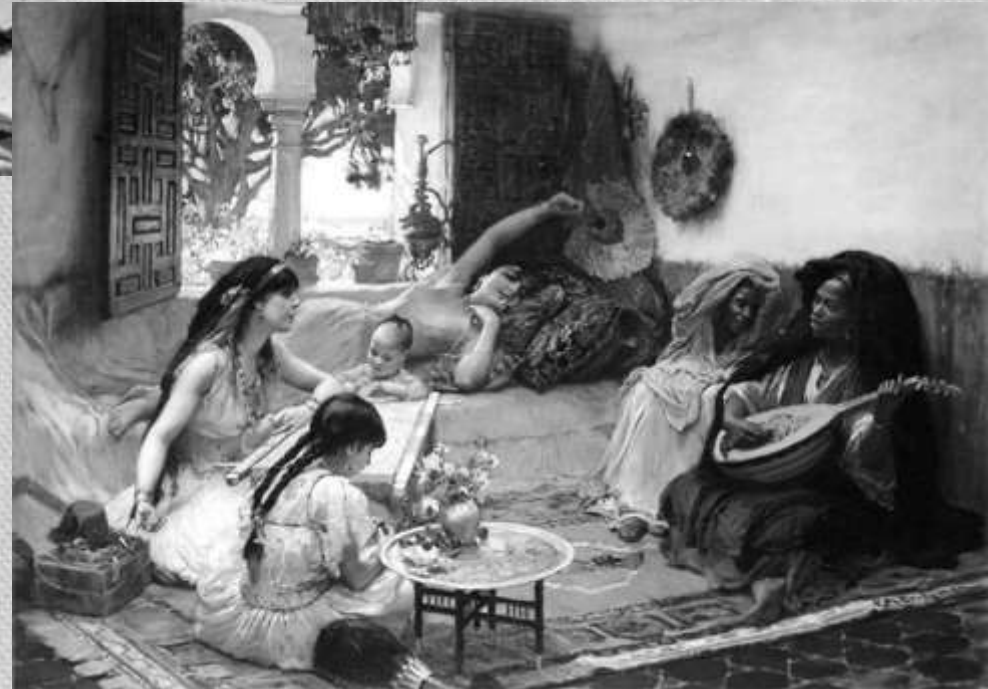
Frederick Arthur Bridgman. L'Après Midi, Algiers . (n.d.).