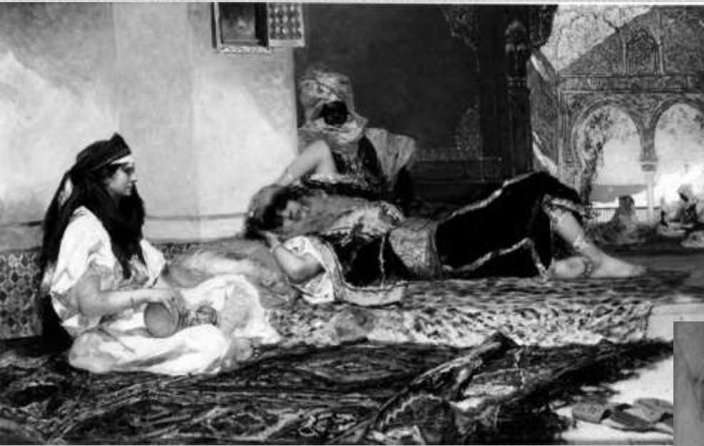
Benjamin Constant. In the Harem . (n.d.).